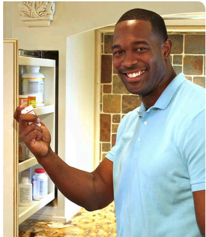
Taking your medicine the way your doctor tells you to is key to getting your blood pressure down where it belongs!

Your doctor has prescribed medicine to help lower your blood pressure. You also need to make the other lifestyle changes that will help reduce blood pressure, including: reaching and maintaining a healthy weight, lowering sodium (salt) intake, eating a heart-healthy diet, being more regularly physically active, and limiting alcohol to no more than one drink a day (for women) or two drinks a day (for men). Following your overall therapy plan will help you get on the road to a healthier life!