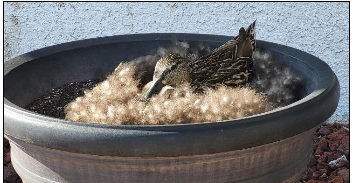
Below: A duck nests in one of the flower pots in the front of our offices.