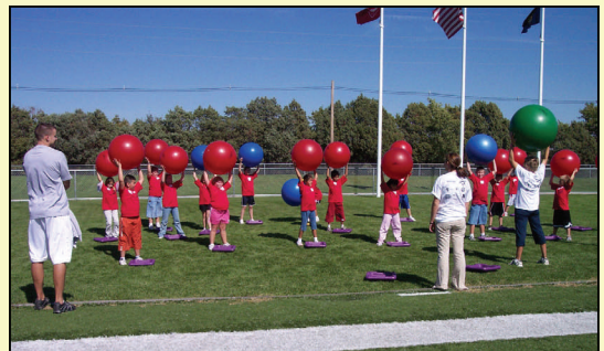
Students participate in NOM Kids Fitness & Nutrition Day

The SHDHD conducted three workshops to educate elementary and middle schools, daycares, pre-schools and youth organizations about the ARF program. Kids participating in ARF, sponsored by the Nebraska Cardiovascular Health Program, aim to be physically active for at least 60 minutes through school, family, and community activities every Friday. The workshops resulted in 776 youth joining the ARF Movement.