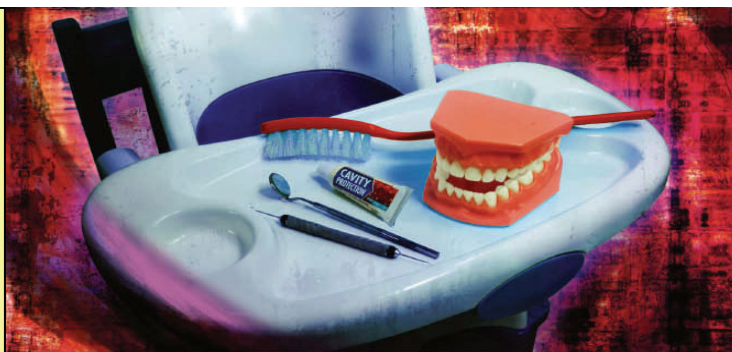
Good dental health starts early in life. Your child's first dental visit should be at age one.

Over the past three years, the Oral Health Coalition has been creating a marketing campaign focused on bringing to the attention of children and pregnant women their risk of dental problems. These target groups were identified by the Coalition after the completion of an assessment by a local marketing firm. The funding for the campaign was received through a grant from the Nebraska Department of Health and Human Services, Dental Health Division.