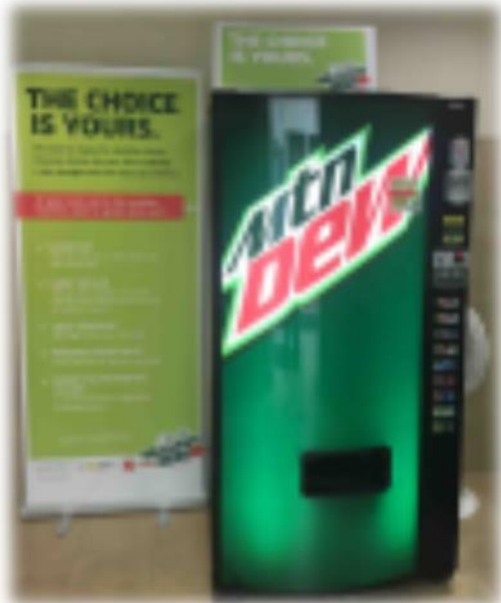
Choose Healthy Here Vending Signage at Brodstone Memorial Hospital

Community Health Improvement Plan (CHIP) Priority: Obesity Prevention Connection strategies: Physical activity promotion, Choose Healthy Here vending and grocery store initiatives, and medical clinic staff training on how to use electronic health records to help identify and care for patients at risk for diabetes and cardiovascular disease.