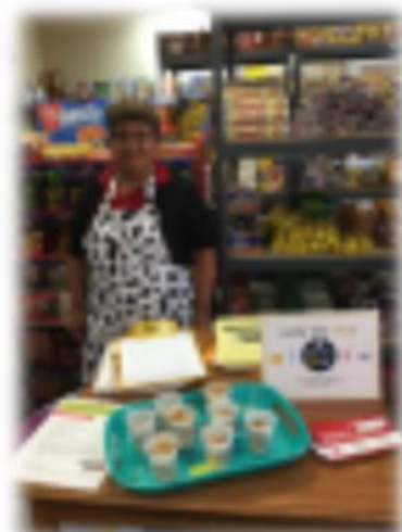
UNL Extension partner displaying and promoting a healthy food recipe