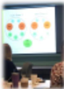
Clinic Informatics Training