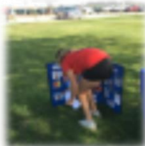
Harvard community member participating in the Sugary Drink Challenge Education booth