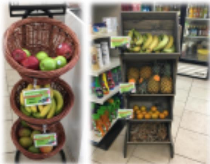
New display units at an ethnic store to promote healthy choices