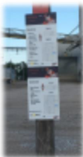
Harvard: Signs promoting walking erected at the High School Track and around the community